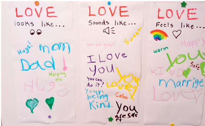
Photo from a Kids' Space group activity.

In 2024, the DAIS Parent/Child Advocacy program supported 77.3% of the families who found refuge in our Shelter — a testament to its essential role in helping children and caregivers begin healing together. Beyond individual support, the program created joyful moments of connection through community-wide celebrations. If there's a holiday, you can count on DAIS celebrating it in Shelter! From seasonal crafts to shared meals, games, and treats, each event brought moments of comfort and fun to families navigating the process of rebuilding their lives.