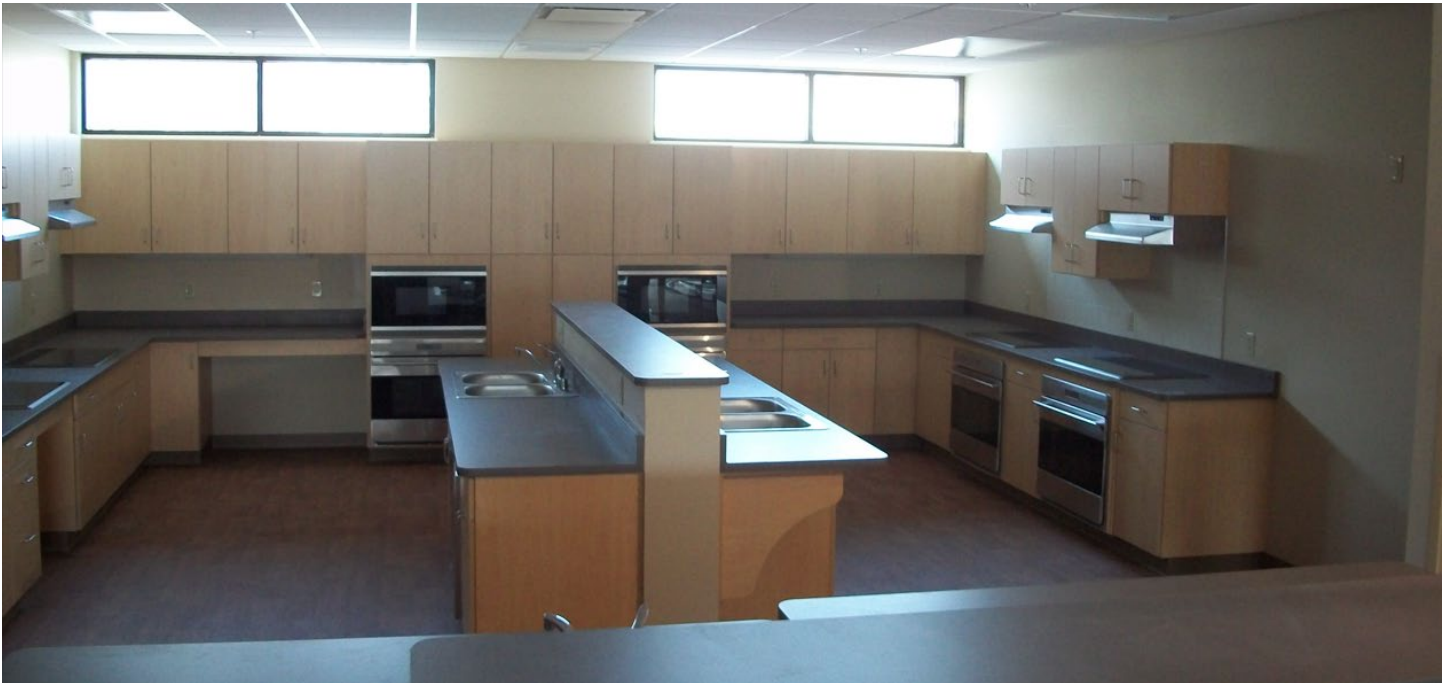
Kitchen from Breakfast Bar