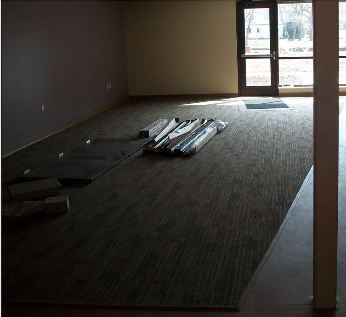
Carpet to replace in Great Room play area