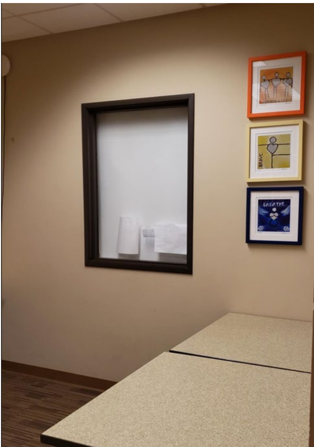
Room B (Library) wall to remove