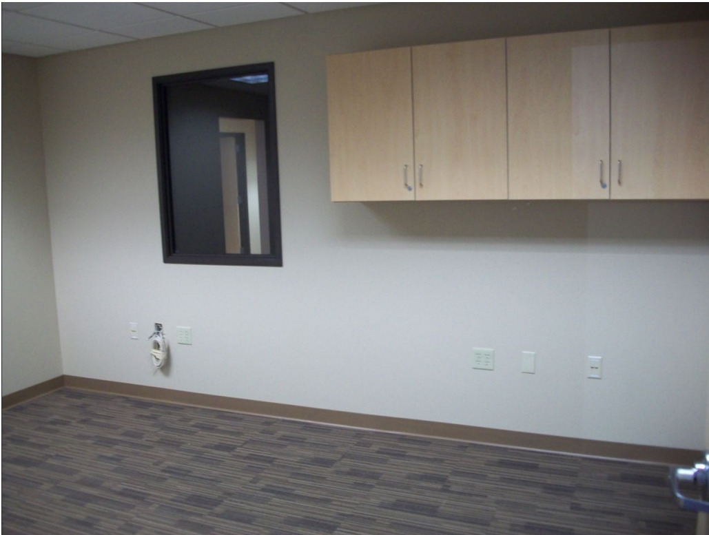
Room A (HUB) wall to remove and window to relocate